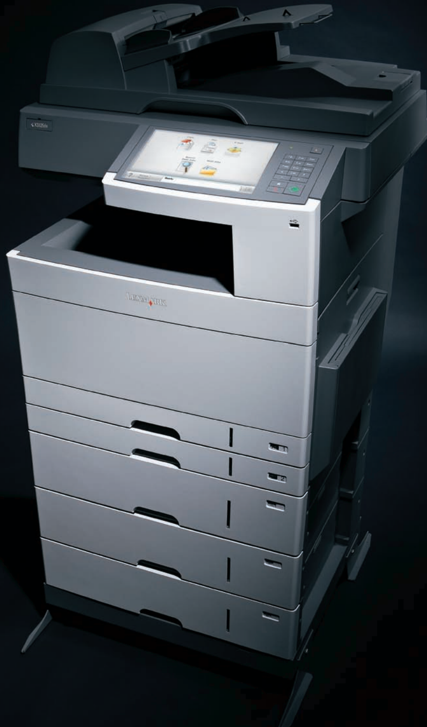
Image enhancer. Workflow advancer.